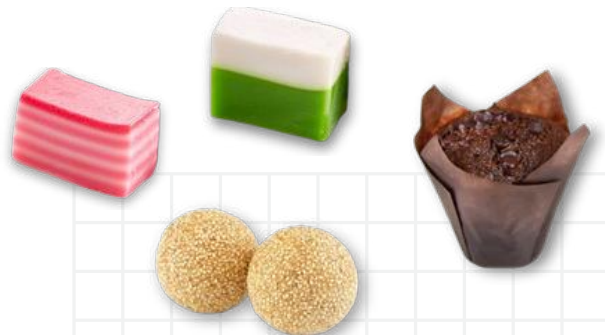
*Variety of Dessert