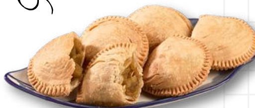
*Traditional Curry Puff