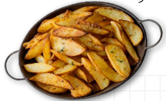
*Deep Fried Potato Wedges