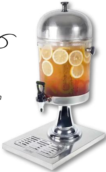
*Refreshing Honey Lemon