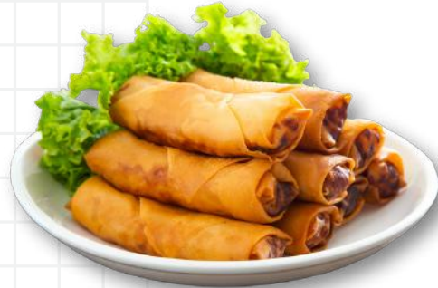
*Vegetarian Fried Spring Roll